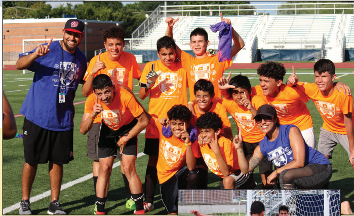
High-needs and at-risk youth benefited from the Arlington Gang Prevention Task Force's 13th annual soccer tournament.